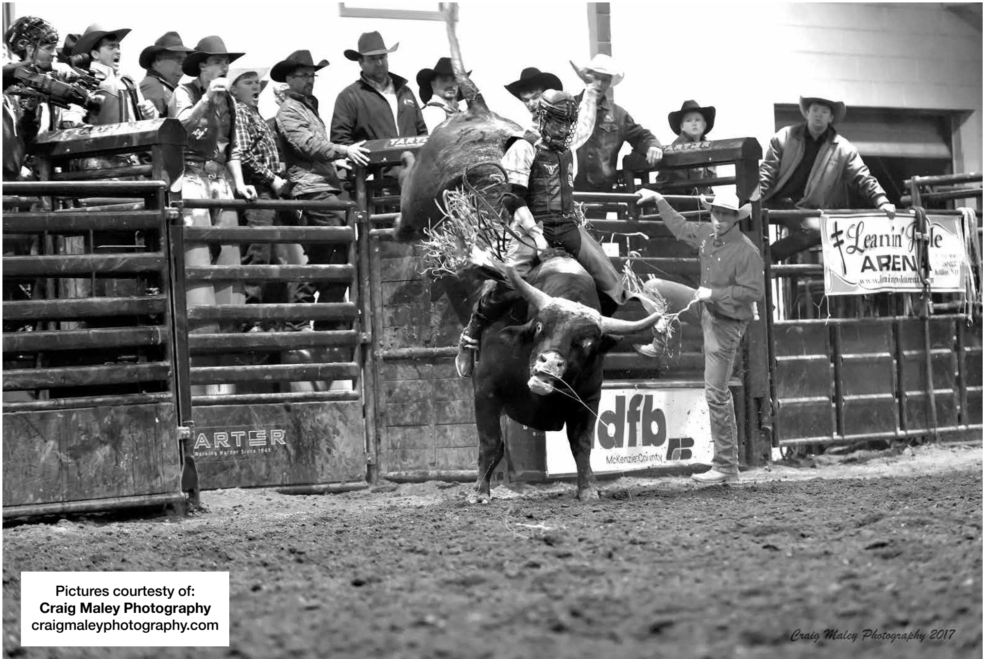
Bull Riding at NDRA Finals